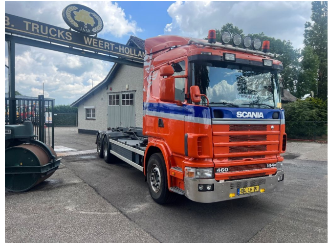
Scania V 8 144.460 MANUAL GEAR