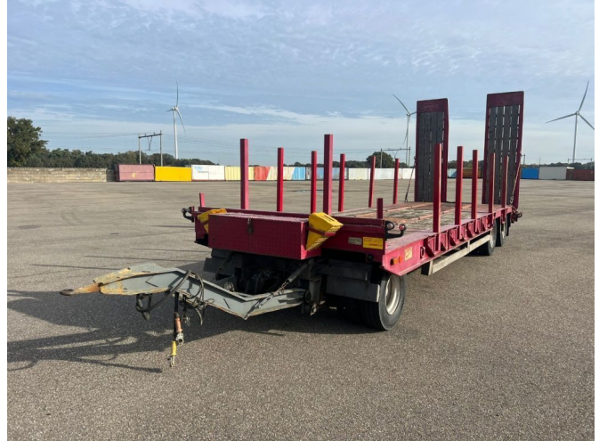
ATM 3 assen bladgeveerd