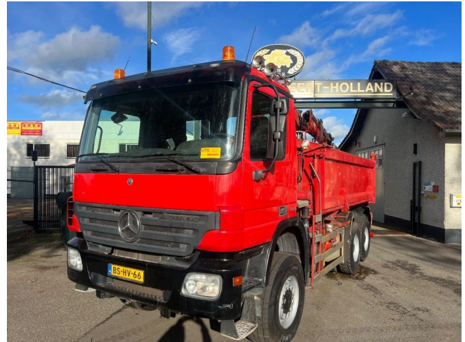
Mercedes-Benz Actros 3336 AK 6x6 Steel Springs CRANE TI...