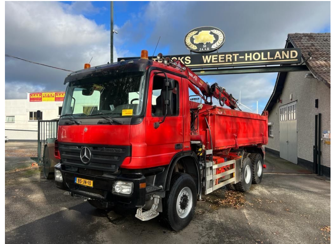
Mercedes-Benz Actros 3336 AK 6x6 Steel Springs CRANE TI...